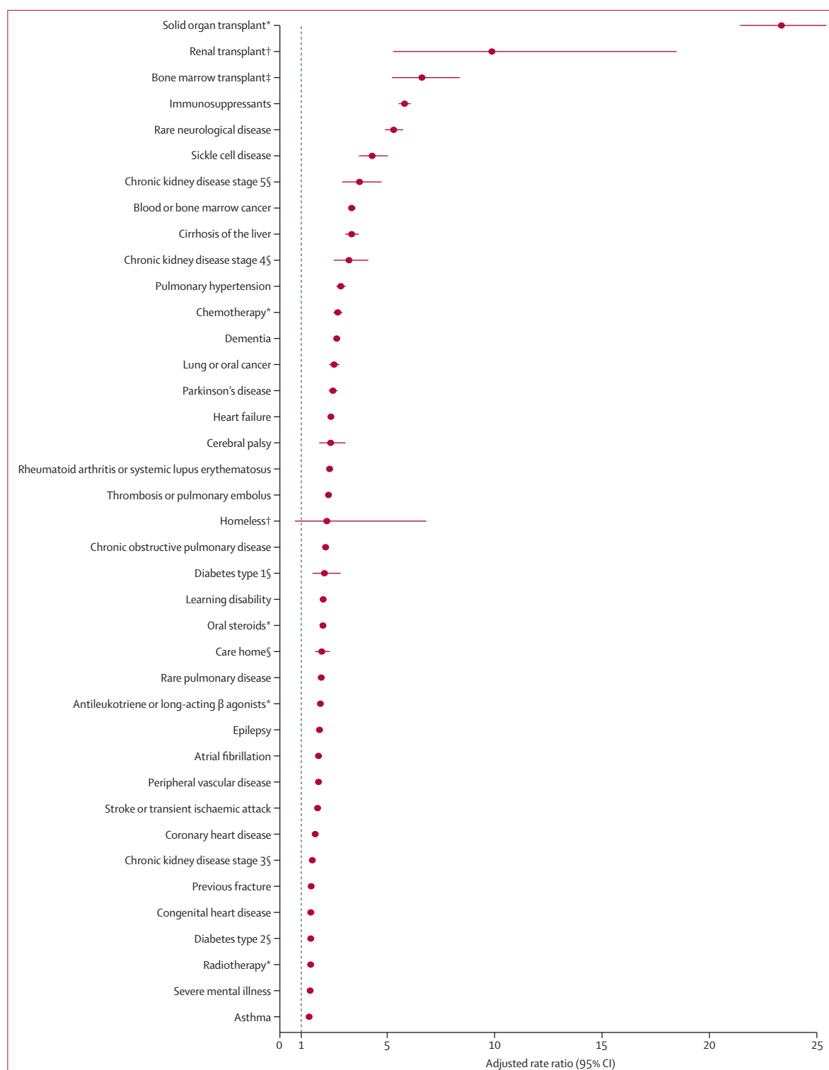
Figure 3: Pooled analyses of Poisson-adjusted rate ratios for specific clinical risk factors associated with COVID-19-related hospitalisation or death among individuals who received booster doses of mRNA-1273 or BNT162b2 Adjusted for non-clinical factors only; reference category for each is absence of the condition. *England and Wales. †Wales only. ‡England only. §Scotland and Wales.